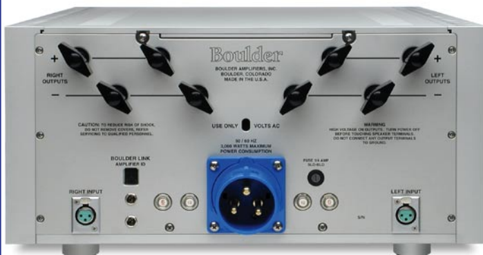
Ultra-high current power connector

Easy to connect, rugged, high current, speaker terminals require no tools